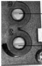
Yellow dial unset (Arrow towards you)