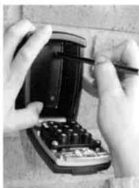
Using the pencil mark the position of the screw holes to be drilled