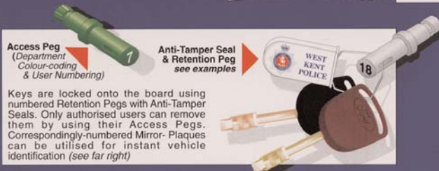
KEYMANAGER ACCESS USER CHART