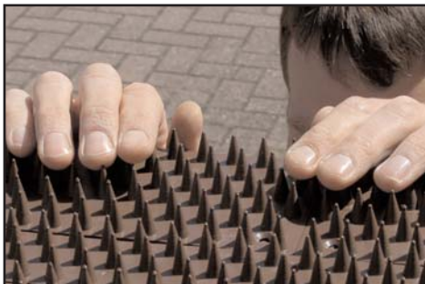
protecting against would be climbers or intruders without the risk of causing life threatening injuries