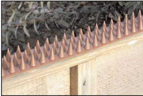
Prikla Strip used as a fence topping