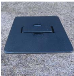
Shown in ground