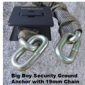
Big Boy Security Ground Anchor with 19mm Chain