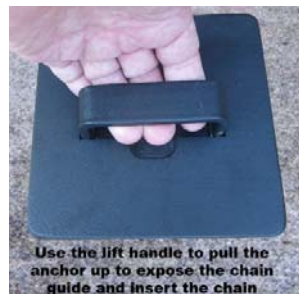
Use the lift handle to pull the anchor up to expose the chain guide and insert the chain