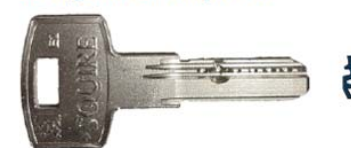
Stronghold E1 Dimple Pin

The Squire Stronghold Elite 1 dimple system combines a conventional sawtooth key system with a dimple system.