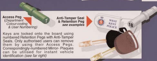
KEYMANAGER ACCESS USER CHART